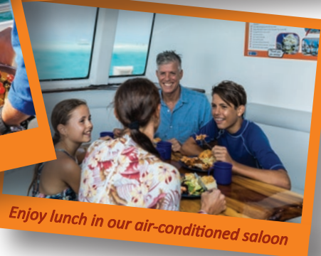
Enjoy lunch in our air-conditioned saloon

FOR THE DISCERNING TRAVELLER WANTING FIRST CLASS SERVICE WITH THAT FRIENDLY OZZIE TOUCH "OCEAN FREEDOM" IS A MUST DO EXPERIENCE.