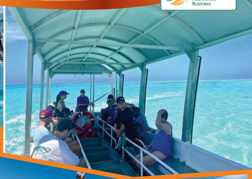
Enjoy our complimentary Glass Bottom Boat Tour - learn about the Great Barrier Reef & marine life with dry feet!