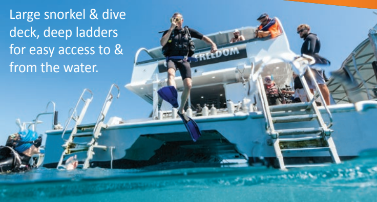
Large snorkel & dive deck, deep ladders for easy access to & from the water.