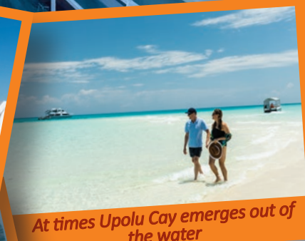
At times Upolu Cay emerges out of the water