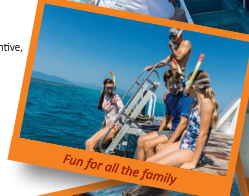
Fun for all the family