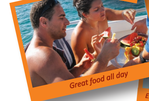
Great food all day